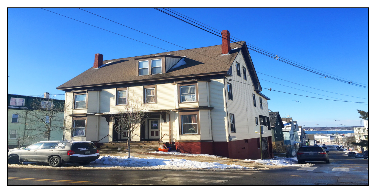
4,326± SF Seven Unit Investment Property

Cardente Real Estate is pleased to offer for sale 149-151 Cumberland Avenue in Portland. This property is located in Portland's East Bayside neighborhood. Surrounding businesses include Union Bagel, Ten Ten Pie Bakery, Rising Tide Brewery, Coffee By Design and many others. Walking distance from downtown, this is a highly desirable location for tenants. In addition, rental rates are on the rise which presents an opportunity for investors. 149-151 Cumberland are currently deeded separately as a 4-unit and 3-unit divided by a firewall. Many of the units feature hardwood floors, built ins and other period details, and bay views from the top two floors. This property could be ideal for an investor or an owner occupant.